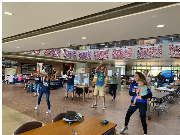
Pictured: Activities from Recover-Con 2021 at Sauk Valley Community College

Check out our upcoming Events and join our celebration of recovery groups that are being provided through Sauk Valley Voices of Recovery.